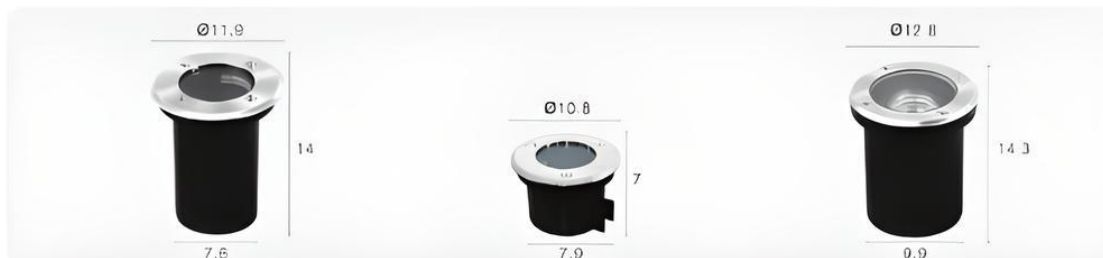
VL-13-6554+B/G5.3 VL-13-6554+B/GU-10 ⌀ 10 cm.